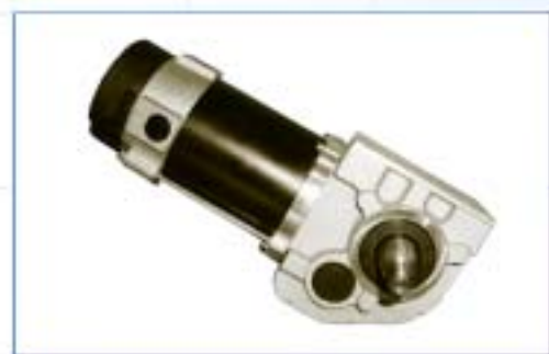
■ New Hammer Motors