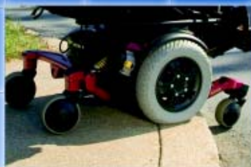
■ Mid-Wheel 6 allows six wheels on the ground