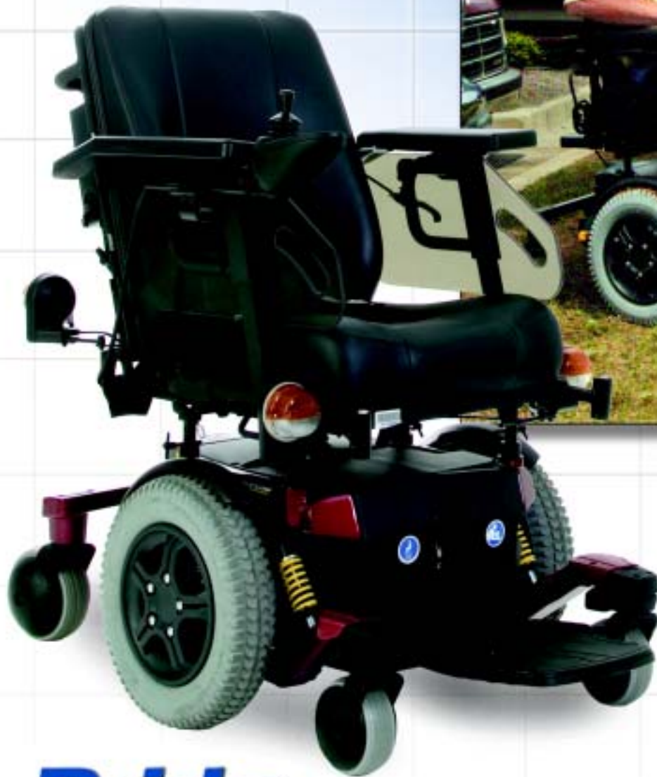
Q6000 Shown in Red with Euro Comfort seat and PG Remote Plus controller