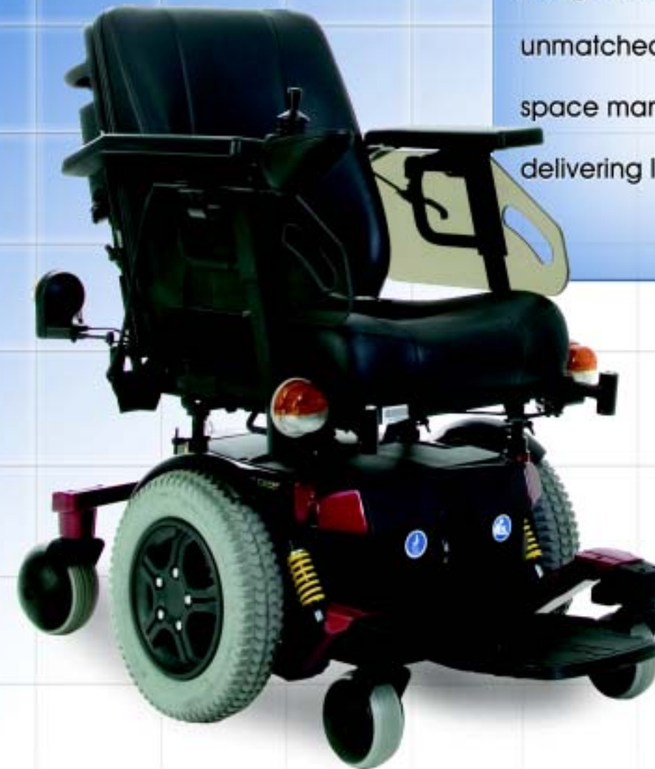
Q6000 Shown in Red with Euro Comfort seat and PG Remote Plus controller

The Quantum ® 6000 incorporates aggressive new features, powerful 4-pole Hammer motors, and our patent pending Mid-Wheel 6™ design platform to deliver unmatched performance and tight-space manoeuvrability while delivering limitless rehab capability.