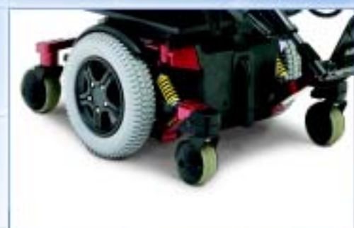
■ OMNI-Casters on front and rear